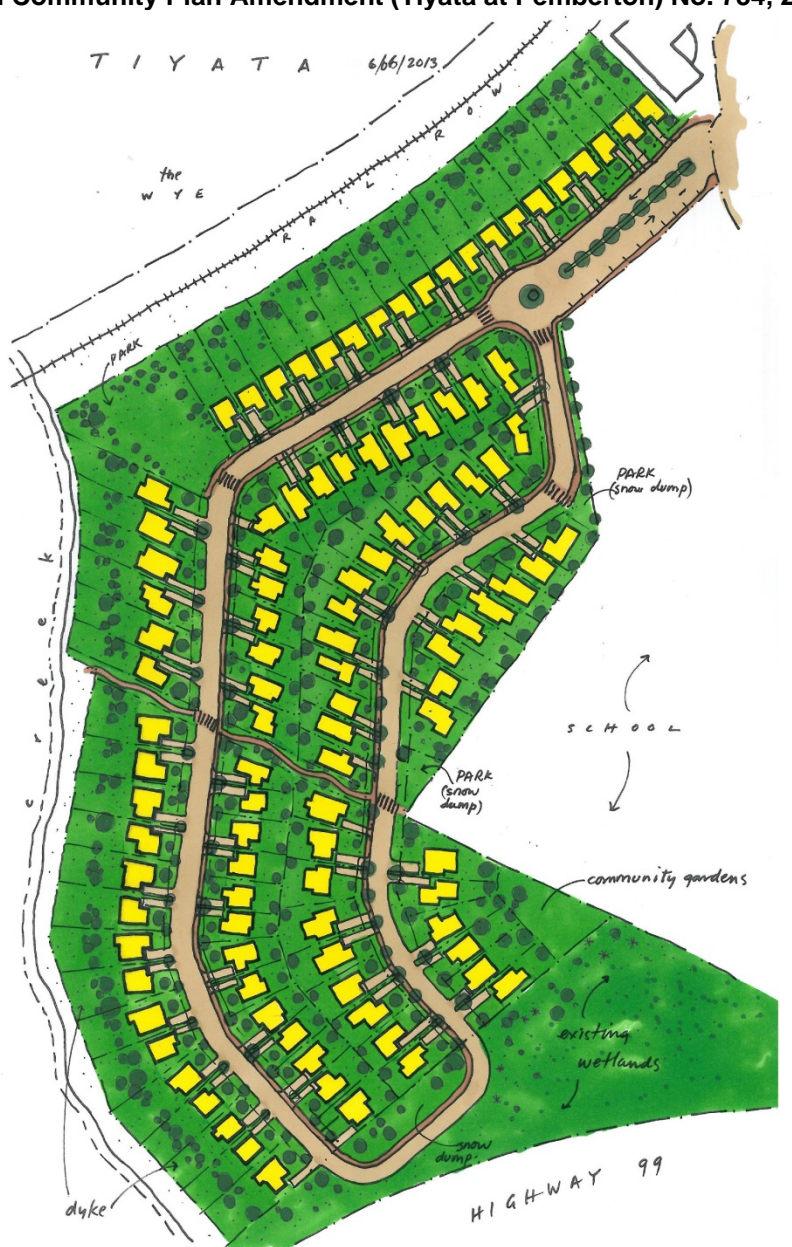
Schedule 2 Official Community Plan Amendment (Tiyata at Pemberton) No. 734, 2013