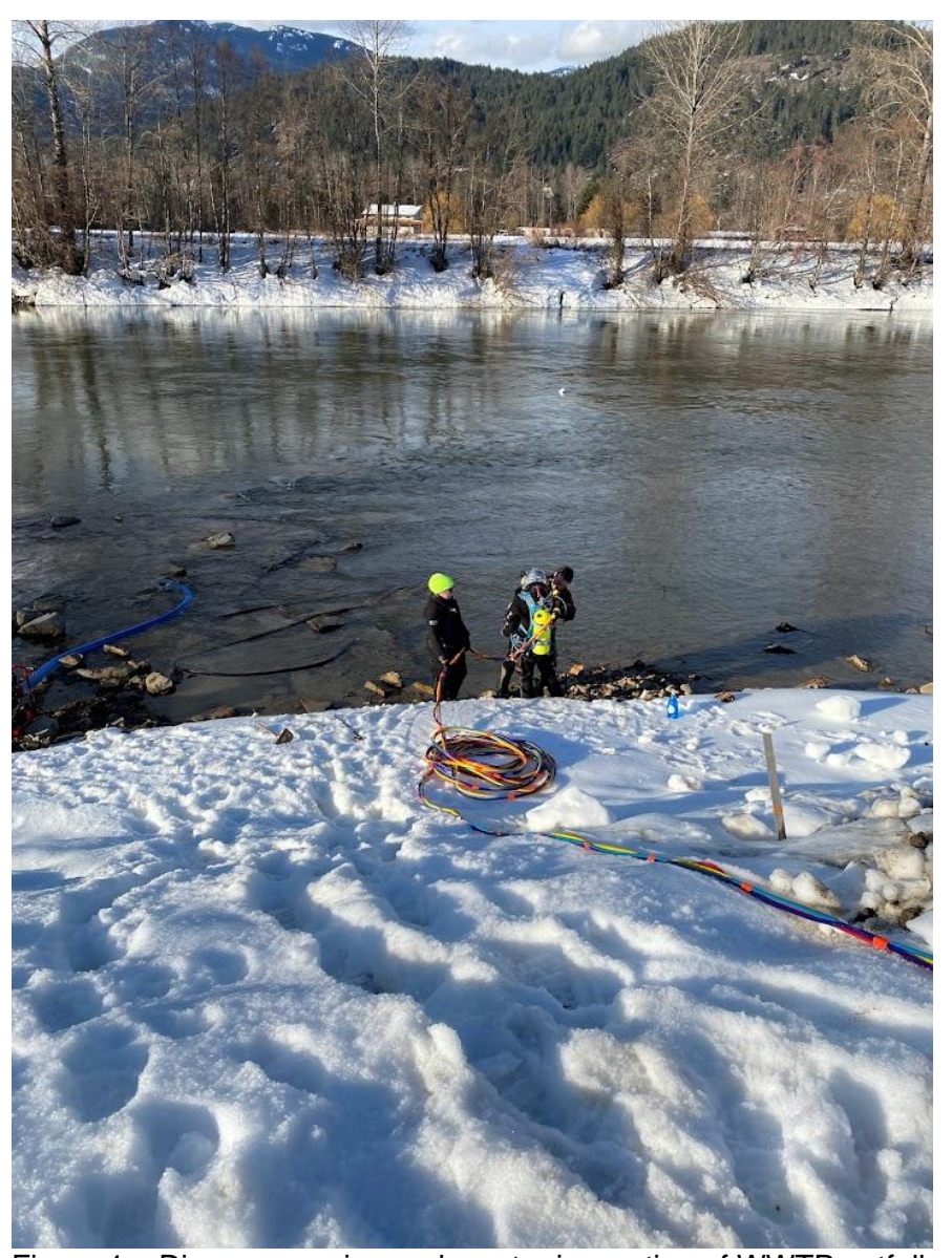
Figure 1 – Divers preparing underwater inspection of WWTP outfall

Below are photos of some of the activities that took place in the first quarter.