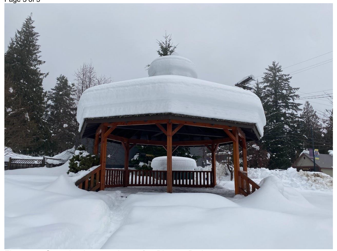
Figure 2 – Snow load on gazebo roof at Pioneer Park