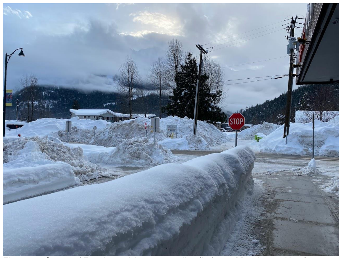
Figure 3 – Corner of Frontier and Aster snow piles (in front of Pemberton Hotel).