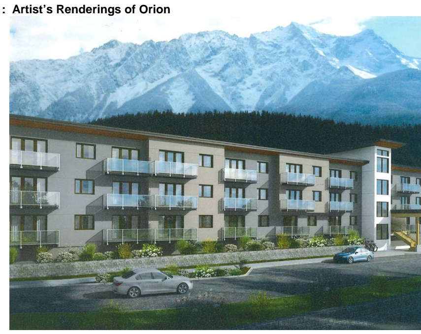
Figure 1: Artist's Renderings of Orion

b) Development: The proposal is to develop a multi-family residential apartment building containing three (3) storeys of residential use founded on a flood resistant concrete parking garage. The building will contain forty-five (45) units in total, fifteen (15) on each floor. The floorplans consist of various sizes ranging from one (1) bedroom to two (2) bedrooms plus den. The size of the building area will be 13,064 square feet, slightly larger than the Radius development, which has a building area of 12,934 square feet square feet. The proposal drawings are attached as Appendix A.