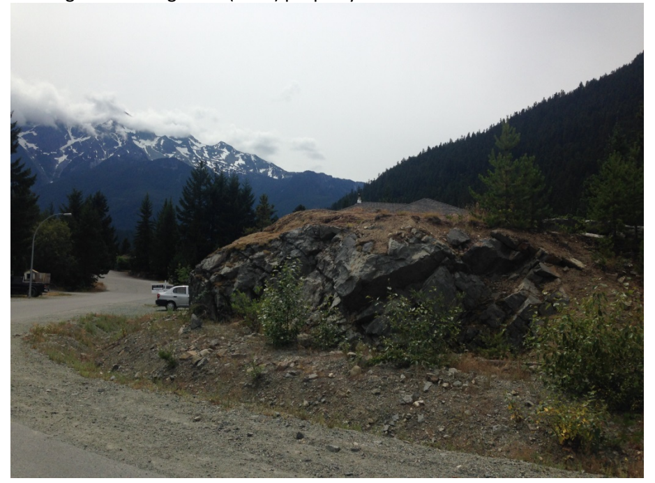
Looking west along north (exterior side yard) property line

Looking south along front (west) property line