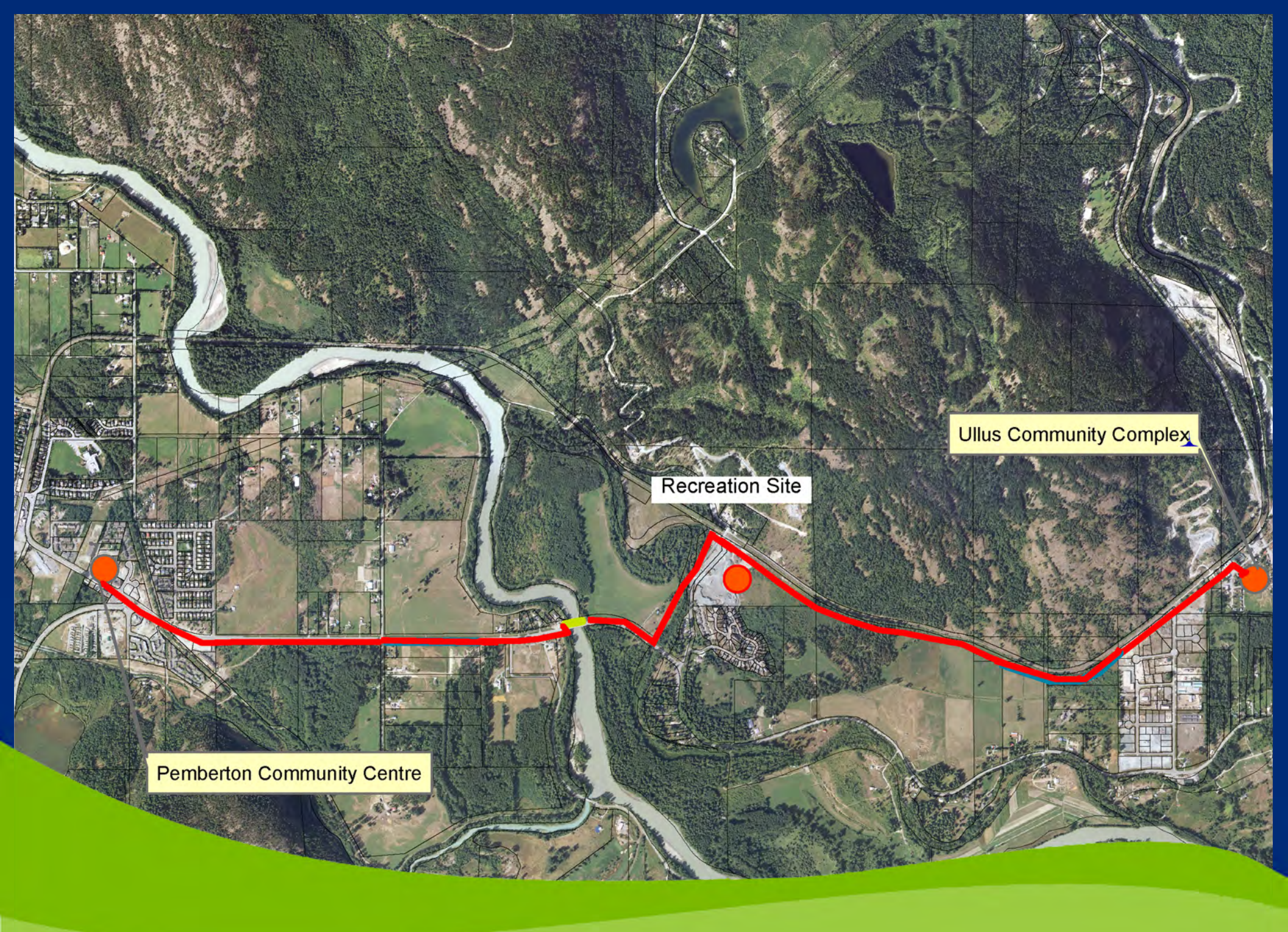
Friendship Trail Alignment & Bridge Location