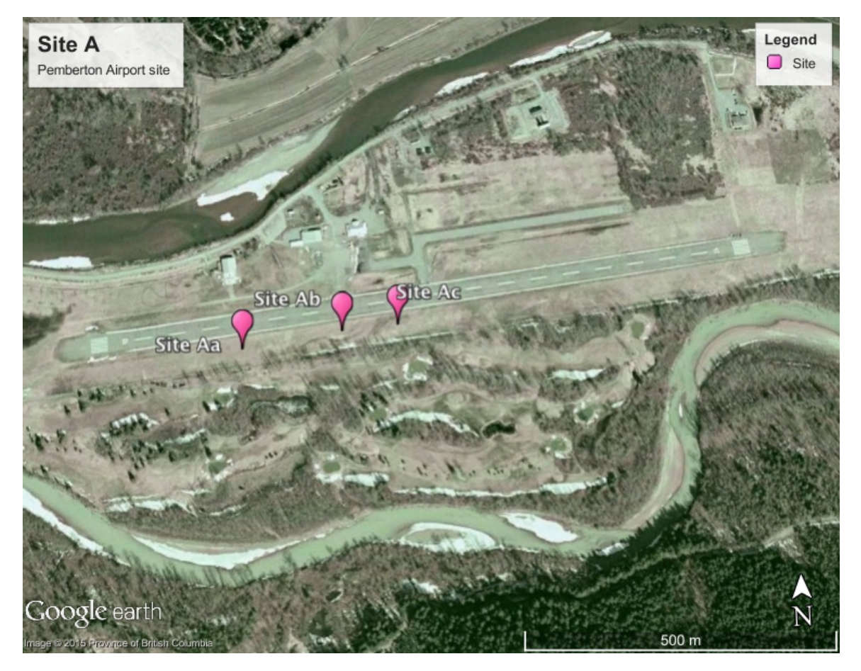
Figure 2. Soil sampling locations at Site A.