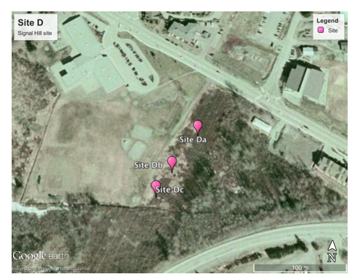
Figure 6. Soil sampling locations at Site D.