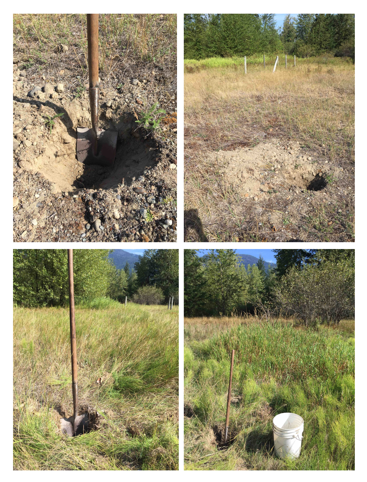
Figure 5. Scenes from soil sample collection at Site BC.