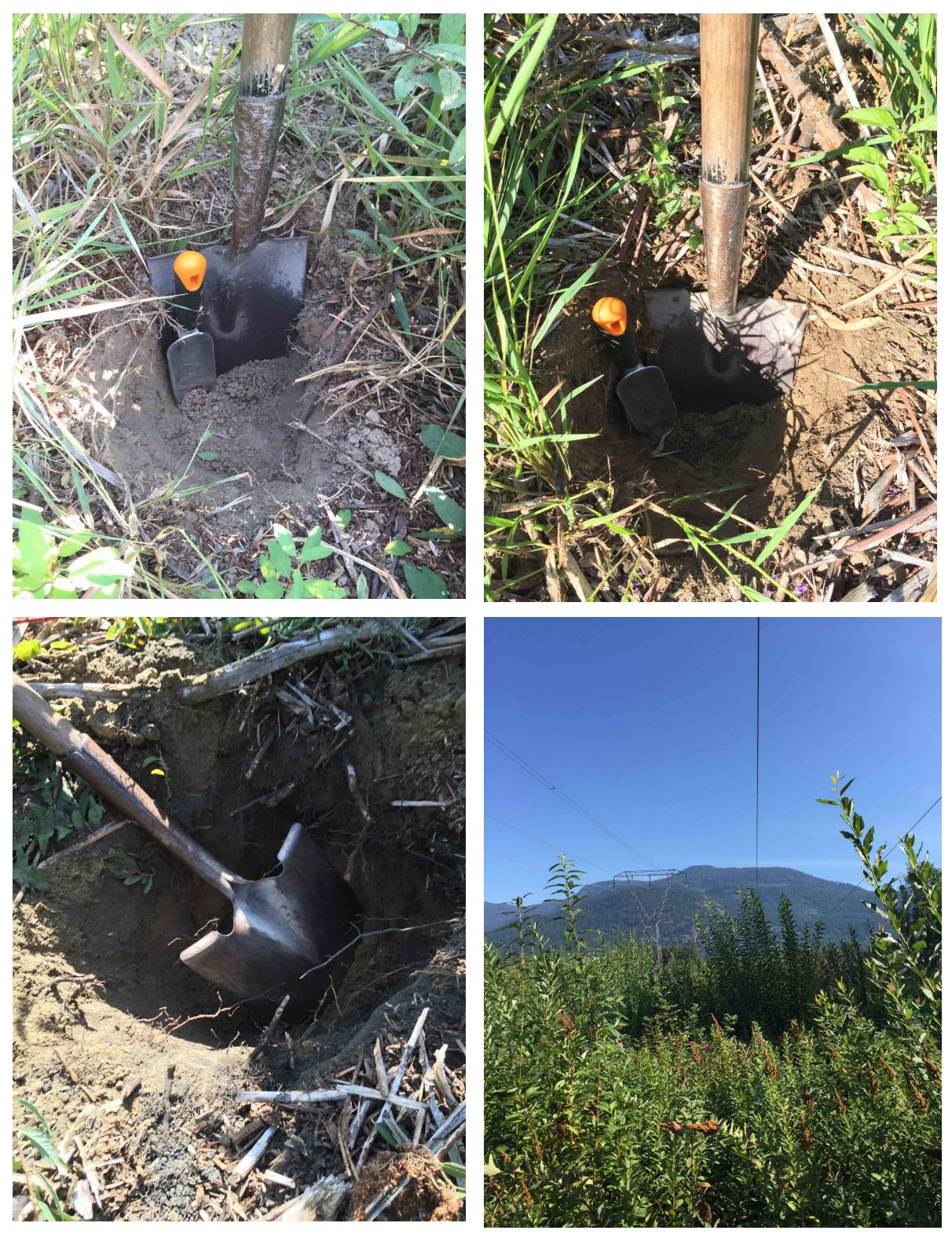
Figure 7. Scenes from soil sample collection at Site D.