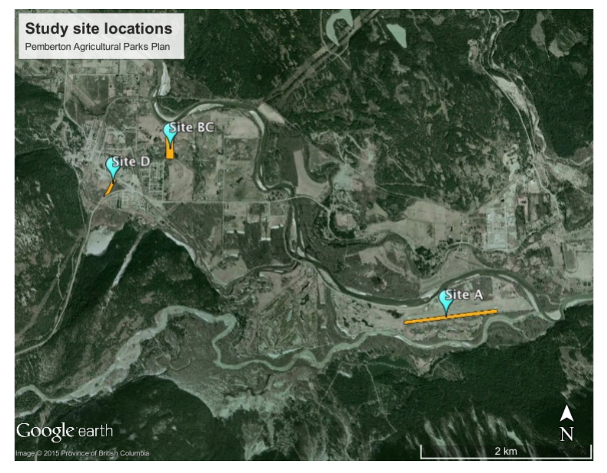
Figure 1. Study site locations within the vicinity of Pemberton, BC.

This Soil Technical Report is the main deliverable of Phase 1.