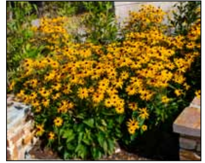
Rudbeckia nitida 'Herbstonne' Herbstonne Rudbeckia